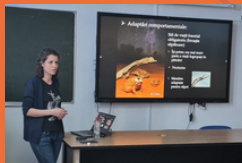
RESEARCH PROJECTS IN BIOLOGY