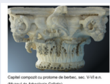
Capitel compozit cu profilul de barbier, sec. V-VI e.n. (Muzeul de Arheologie Calafat)